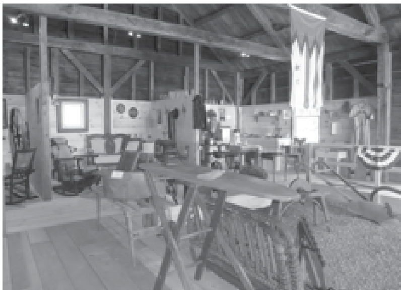
Displays at Razorville Hall