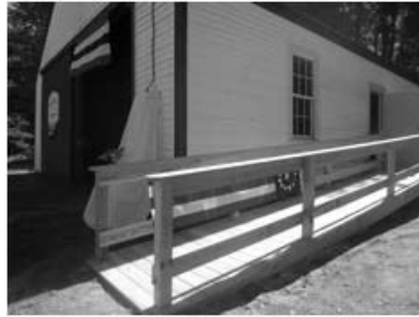
Handicap accessible ramp at Razorville Hall

Improvements at Razorville Hall, our museum located in the town's original town house, has been our major project. We accomplished having the roof re-shingled and adding a handicap assessable ramp. The roofing project was funded with donations, fundraising projects, and the town's financial support approved last year at town meeting. We applied for and received a Knox County Maine Community Foundation grant to pay for the materials and labor for the ramp construction with members doing the groundwork. This work was completed throughout the summer.