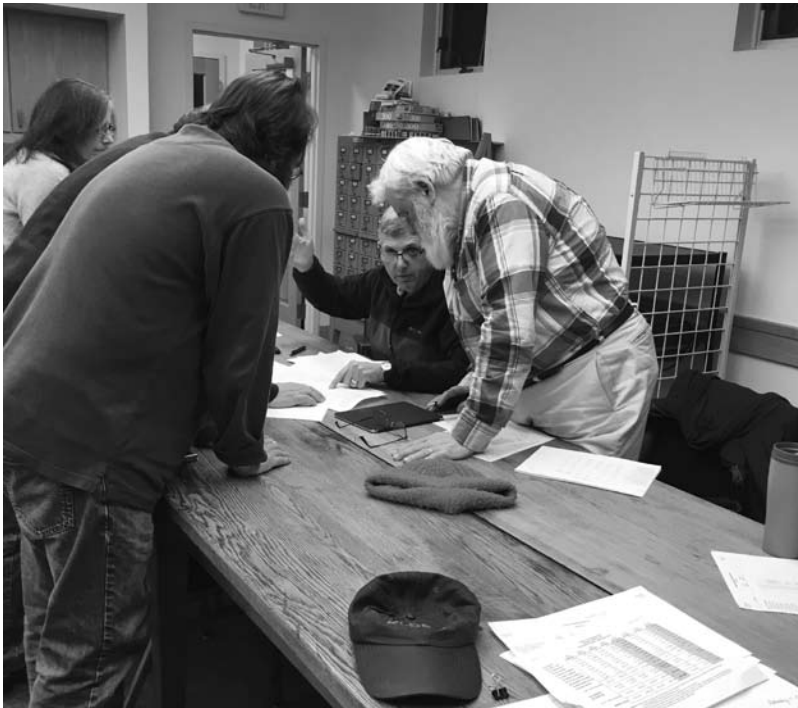
Budget Committee putting their heads together on 2016 budget

Anticipated Revenues: This year anticipated revenues used to offset taxes are up by $34,900, including expected increases in State Revenue Sharing and a larger Unexpended Fund Balance. That's a 9.7% increase in funds that directly reduce taxes.