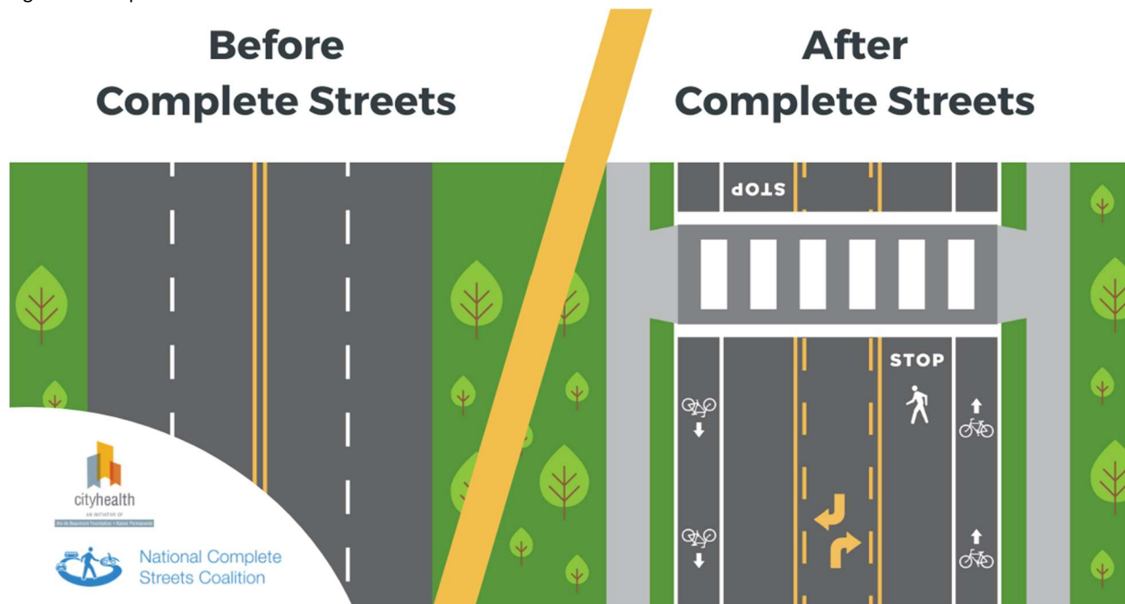
Figure 1. Complete Street Intervention