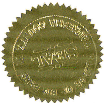
Ian Haas, Village Clerk