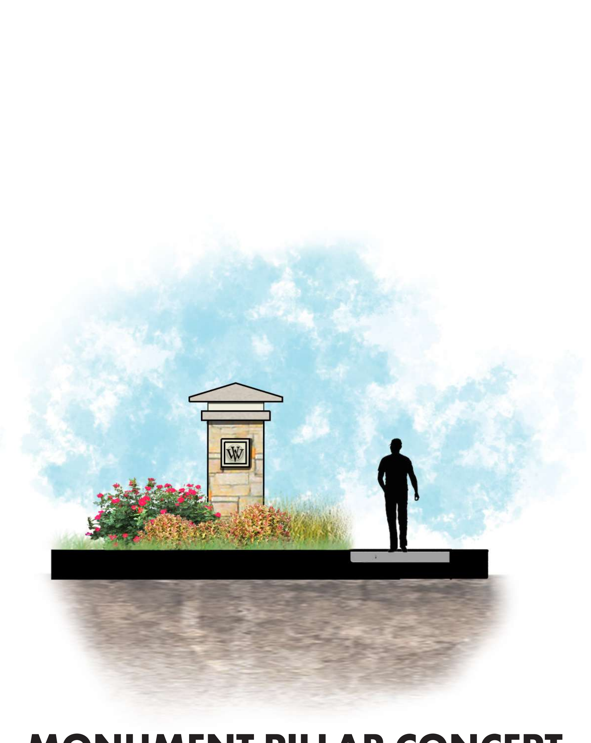
MONUMENT PILLAR CONCEPT