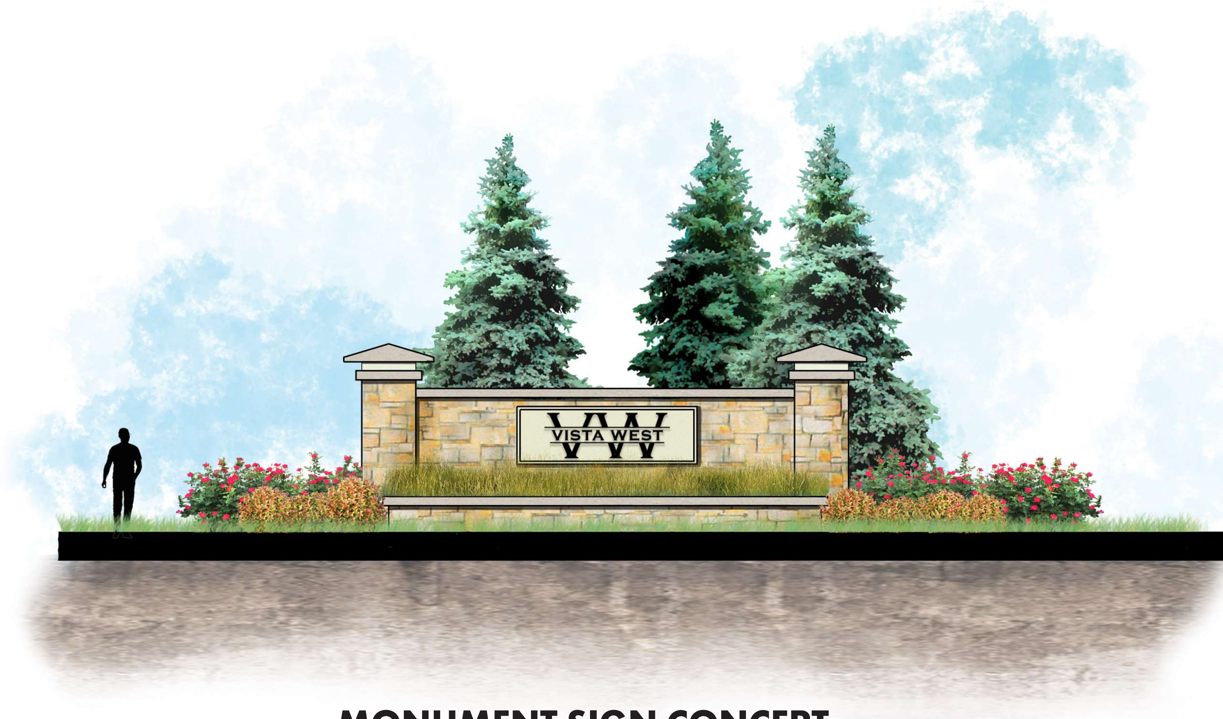
MONUMENT SIGN CONCEPT