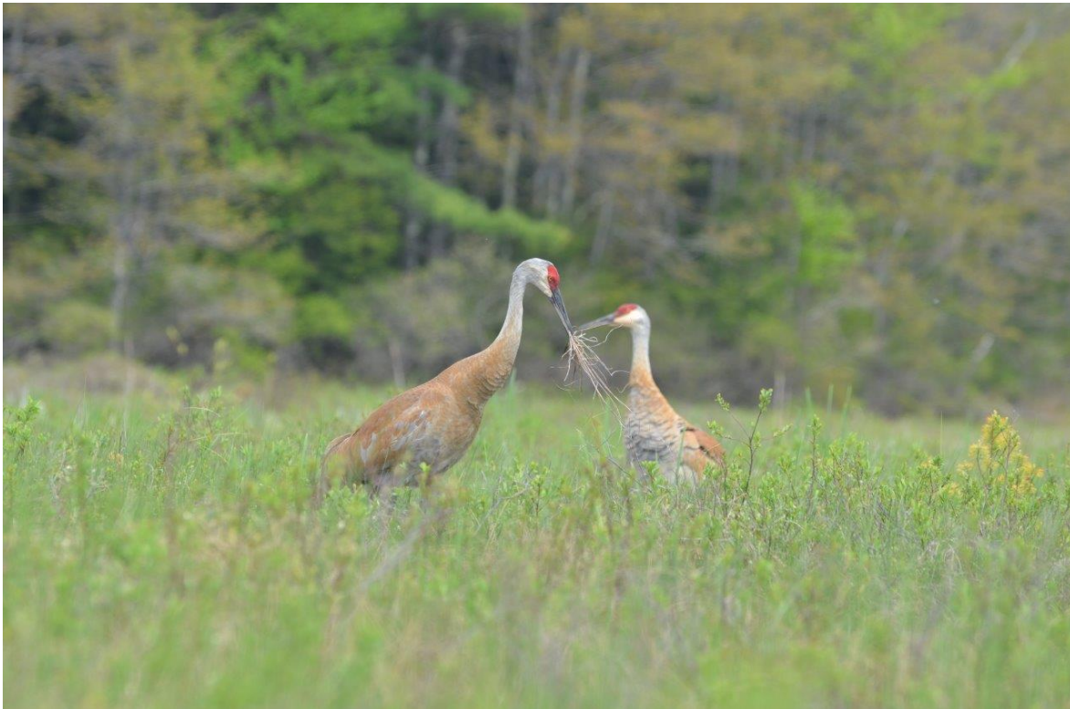
"Sandhill cranes build their nest in a marsh on Torsey Pond. "

We hope that if you live on the pond, or boat, fish, or swim in Torsey that you will consider joining us. Torsey is at the head of the Cobbossee Watershed, which makes it especially important since other ponds in the watershed take in what Torsey sends out! FMI email: TPAinfo@torseypond.org .