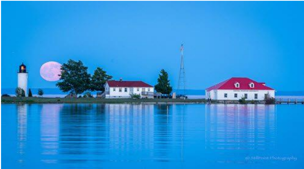
Whiskey Point: Light Tower, St. James Township Hall, Central Michigan University Boat House