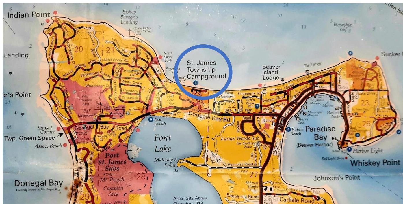
St. James Township Campground North Shore of Beaver Island in Lake Michigan

Donegal Bay Road one mile west of St. James, Beaver Island