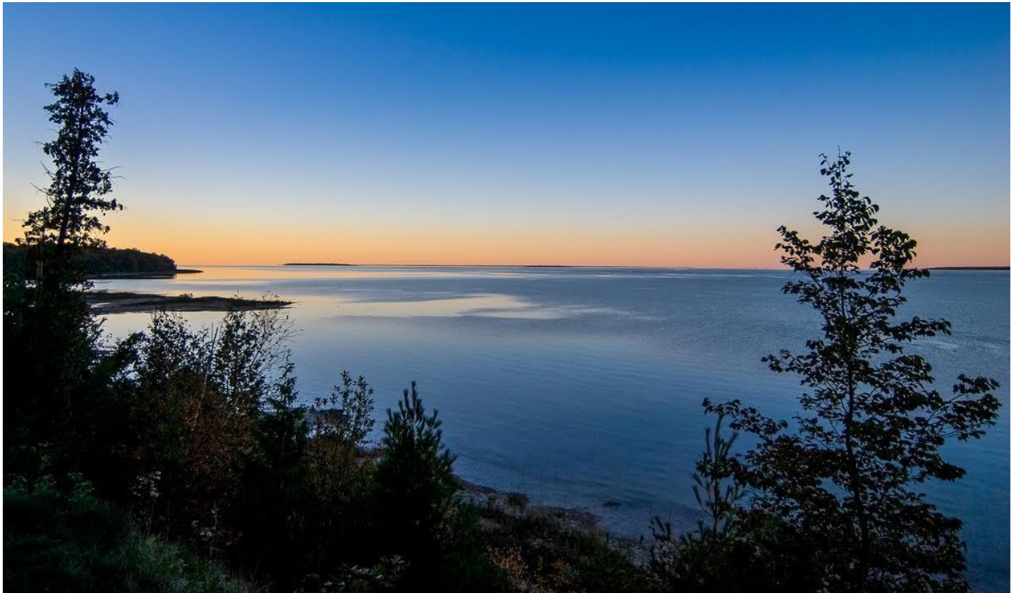
Sunset from St. James Township Campground