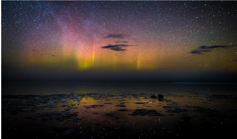
Northern Lights from Beaver Island

You will enjoy beautiful sunsets and may be lucky enough to view the Northern Lights. Definitely a dark sky destination!