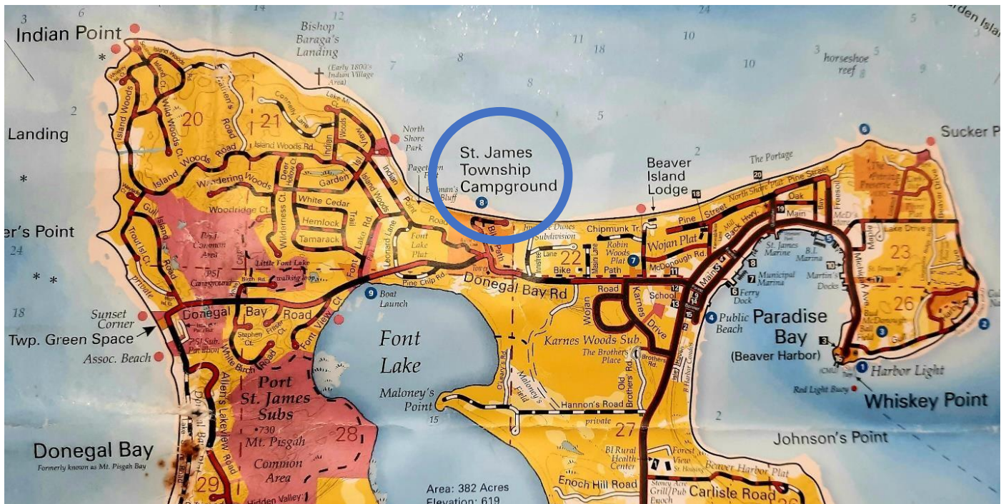
St. James Township Campground North Shore of Beaver Island in Lake Michigan

Donegal Bay Road one mile west of St. James, Beaver Island