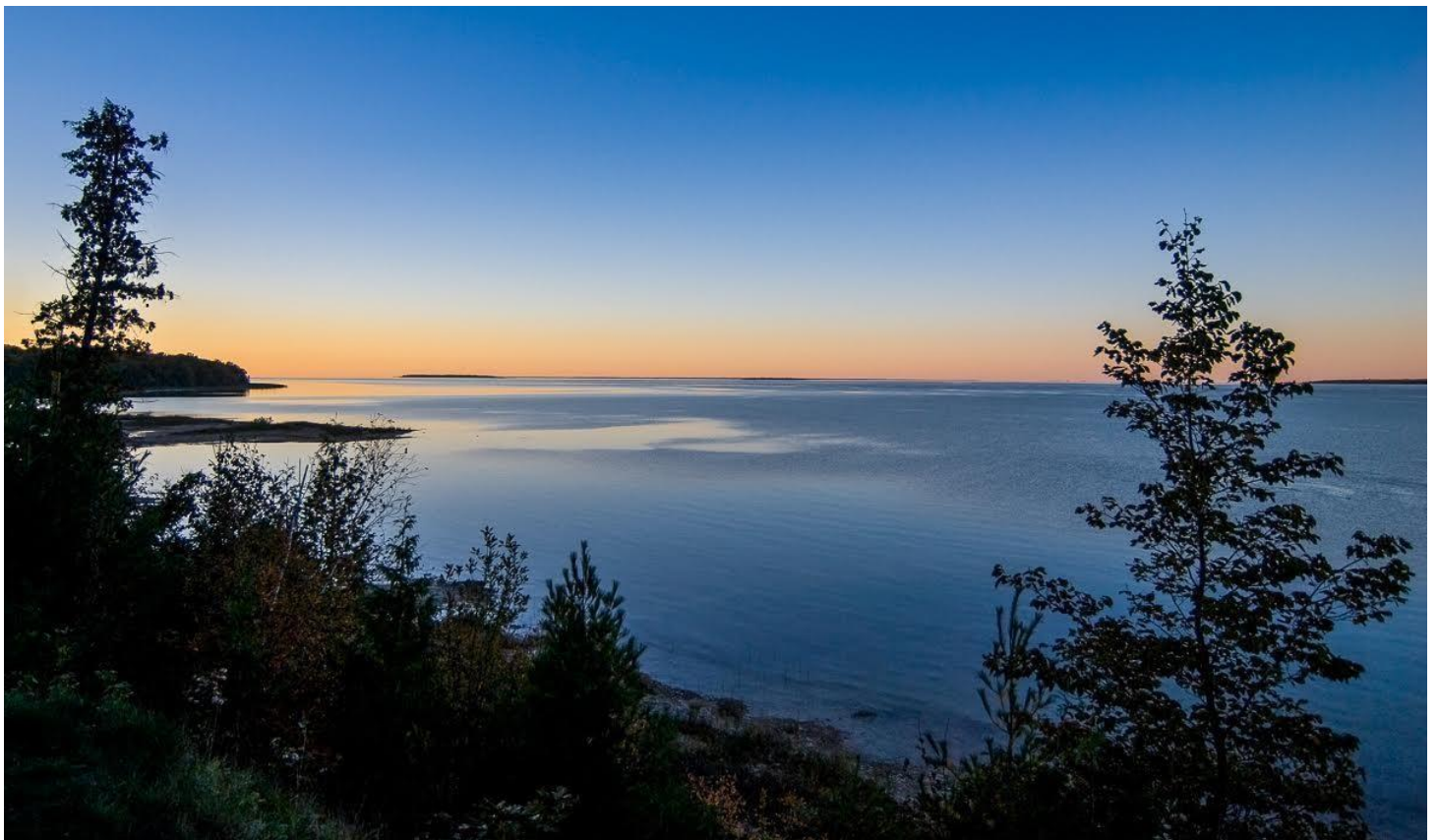
Sunset from St. James Township Campground