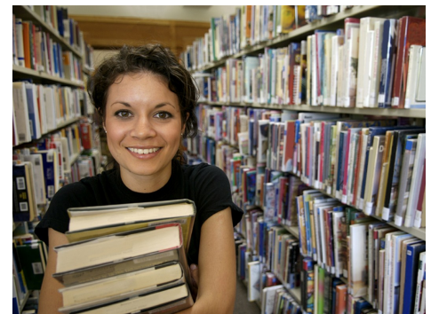
Celebrate Library Card Sign-Up Month at your public library!

Library Card Sign-Up Month is held annually during the month of September. For more information on the national celebration, please visit www.atyourlibrary.org .