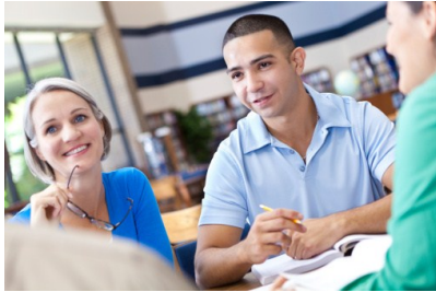
Join the exciting discussions at the First Tuesday and First Wednesday Book Clubs this month!