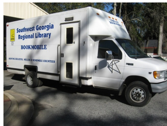
Visit the Bookmobile for the latest and greatest books, DVDs, and more!