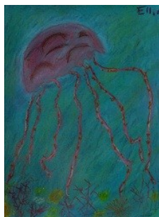
Visit the River of Words display at your library this month!

of the Georgia Department of Natural Resources, is a poetry and art contest open to grades 4 – 12 on the theme of watersheds. This exhibit showcases the state contest winners. Make sure you come and see the lovely art and poetry created by these talented young Georgians. The River of Words contest is coordinated by the Georgia Center for the