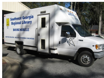
Visit the Bookmobile for the latest and greatest books, DVDs, and more!