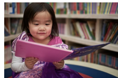
The Miller County—James W. Merritt, Jr. Memorial Library was awarded a Books for Children grant!

will have a special bookplate inserted acknowledging the generosity of Southwind Ford and the Libri Foundation.