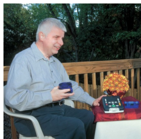
Download digital books using BARD (Braille & Audio Reading Download)!

You can download the digital books to a USB flash drive or on to a blank talking book cartridge. USB flash drives have a