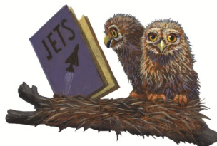
Register your child or teen for the 2012 Vacation Reading Program beginning Monday, May 14, 2012!

Register in person at any library location or online at