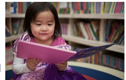
The Miller County—James W. Merritt, Jr. Memorial Library was awarded a Books for Children grant!

will have a special bookplate inserted acknowledging the generosity of Southwind Ford and the Libri Foundation.