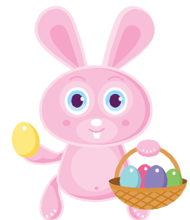
Get ready for Bunny Bash at the Seminole County Public Library!

the Seminole County Public Library at 229.524.2665 to reserve your child's spot today!