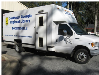
Visit the Bookmobile for the latest and greatest books, DVDs, and more!