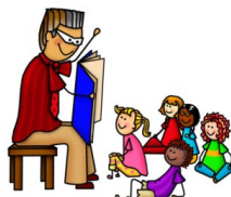
Enjoy storytimes at the library for your little ones!

Toddler Time continues at the Miller County—