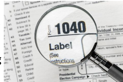
Have your taxes prepared at the library this year!

documents with you: All W-2s and 1099s (if any), Social Security Cards or Taxpayer Identification (ITIN) for all family members, a copy of your 2010 tax return (if available), a bank account and routing number (if choosing to direct deposit your refund), and a valid photo identification.