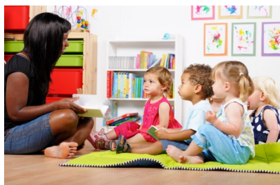
Regularly scheduled storytimes return to your library in August!

There are many positive benefits to attending library storytimes for children. Stories help develop a child's imagination, discover new ideas, and help nurture a child's listening abilities.