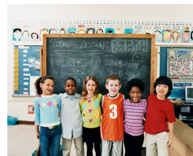
Make this school year your best yet with assistance from the library!

Whether you are a teacher or student, make sure to take advantage of the many resources that the Southwest Georgia Regional Library System offers to make this school year your best yet!