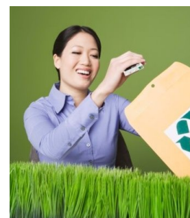
Recycle your used inkjet and toner cartridges at the Southwest Georgia Regional Library System!

inkjet and toner cartridges will be used to support the Vacation Reading Program.