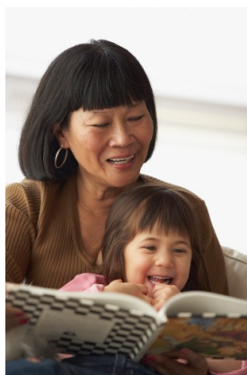
Enjoy storytimes at the library for your little ones!