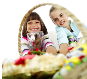
Join us for an Easter Eggstravaganza at your library!

the Decatur County—Gilbert H. Gragg Library at 229.248.2665 for more information on this program.