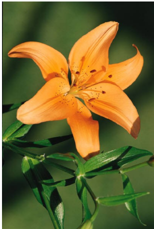
Spring has sprung at the Southwest Georgia Library for Accessible Services!

Spring is one of the four temperate seasons, the transition period between winter and summer. Spring and "springtime" refer to the season, and broadly to ideas of rebirth, renewal and re-growth. The specific definition of the exact timing of "spring" varies according to local climate, cultures and customs. At the spring equinox, days are close to 12 hours long with day length increasing as the season progresses.