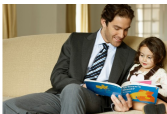
Introduce your little one to the library by bringing them to storytime!