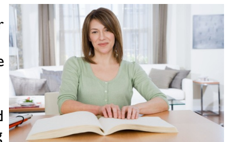
Learn the concepts of marketing on Tuesday, November 8, 2011 from 1-3 p.m.!

College, co-authored a virtual campus marketing course utilizing geographic information system software (GIS) which can be found at www.esri.com , and is the Director of GeoLib (U.S. Public Library Geographic Database). GeoLib is a research program of the College of Communication and Information at Florida State University. Space is limited; please call the Southwest Georgia Library for Accessible Services at 229.248.2680 or 1.800.795.2680 to reserve your spot today.