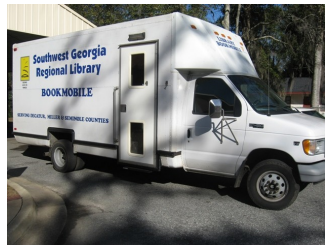
Visit the Bookmobile for the latest and greatest books, DVDs, and more!

Please call 229.248.2665 for more information on how to set up a Bookmobile stop near you.