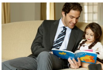
Introduce your little one to the library by bringing them to storytime!

These programs are designed for children ages 18 months—4 years old. Help your child discover the library with these fantastic programs!