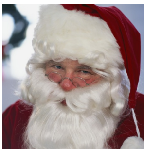
Reserve your child's spot to meet Santa!

Ameris Bank, First State Bank, and People South Bank. The Georgia Rural Library Initiative Grant is sponsoring Breakfast with Santa at the Seminole County Public Library.