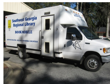
Catch the Bookmobile at a stop near you!

Visit the Bookmobile as it travels to a stop near you!