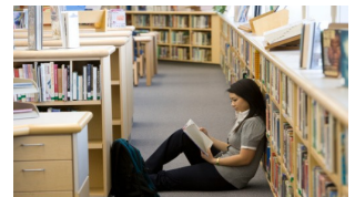
Celebrate Library Lovers' Month at your library this February!