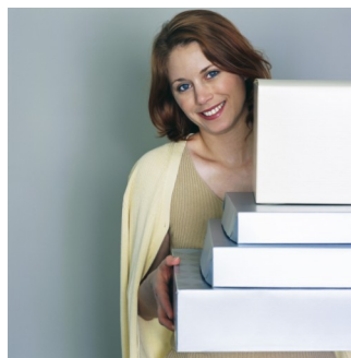
Buy something for that special someone in your life this holiday season from the library!