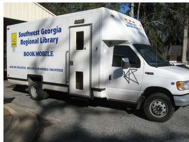
Visit the Bookmobile for the latest and greatest books, DVDs, and more!

Please call 229.248.2665 for more information on how to set up a Bookmobile stop near you.