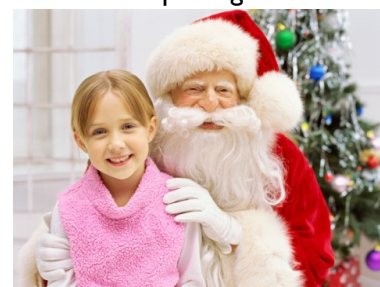
Don't miss the chance for your child to visit Santa at the library!

Saturday, December 10, 2011 for three sittings, which are at 9 a.m., 10 a.m., and 11 a.m. Space is already filled for this program, which is sponsored by First Port City Bank and is suitable for children up to age 9.