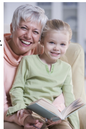
Give the gift that the entire community can enjoy!

can send a check so the library can order the item. This is a great gift idea for that person in your life who is difficult to buy for. Each book will have a special bookplate inserted recognizing your loved one. You