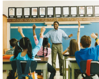
Teachers, let the Southwest Georgia Regional Library System assist you in making this the best school year yet!

www.swgrl.org/homework_alert.php . Simply fill out the online form with the assignment details, and we will be able to gather materials from our library and others around the state. This way, the materials will be easily accessible for your students.