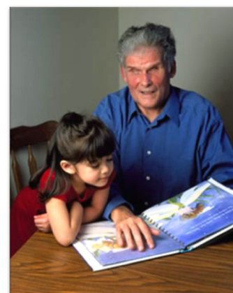
Introducing the Southwest Georgia Library for Accessible Services!

Southwest Georgia Library for Accessible Services