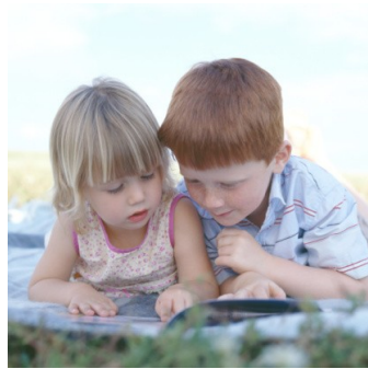
Storytimes at your library resume this August! Bring your little one for stories, songs, games, crafts, and a whole lot more!