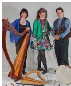
Don't miss Celtic Fire at the Decatur County—Gilbert H. Gragg Library!

This concert is sponsored in part by the Decatur County – Gilbert H. Gragg Library Foundation. The concert is also supported in part by the Grassroots Arts Program of the Georgia Council for the Arts through the appropriations of the Georgia General Assembly and in partnership with Lowndes-Valdosta Arts Commission, Inc.