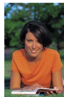
Join us for the First Wednesday Book Club at the Seminole County Public Library!

next issue of the SWGRL Spotlight for more information.