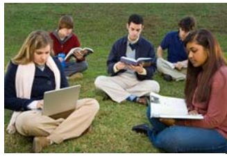
Find resources to obtain college scholarships at your library!

Researching and applying for scholarships is on the mind of many high school students and parents. Scholarships are excellent ways to help fund a college education. There are many scholarships available, and the library is here to help you with the resources you need to find available scholarships. The library has many books to help, including Scholarships for African-American Students , 501 Ways