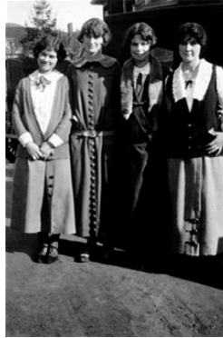
Celebrate Women's History Month at your library!

Visit your library for these and other titles to celebrate Women's History Month!