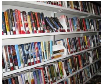
Browse the wide array of books available aboard the Bookmobile!