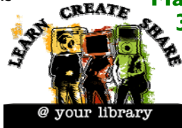
Celebrate Teen Tech Week March 7—13, 2010 at your library!

educators and other concerned adults. Celebrate Teen Tech Week at the library by playing a variety of games on the Nintendo Wii and the PlayStation 2. Join us at the Decatur County—Gilbert H. Gragg Library on Tuesday, March 9, 2010 at 3:30 p.m. Play an assortment of video games on the Nintendo Wii and PlayStation 2 on Wednesday, March 10, 2010