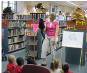
It's time for toddlers at your library!

Thursday at 10:30 a.m. and 4 p.m. for stories, songs, fun, and more at your library with Toddler Storytime!