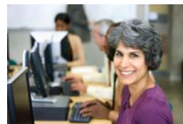
Learn to use a computer with ease this month!

use the mouse and keyboard, the Windows environment, how to use Microsoft Word 2007, and how to use the Internet and E-mail. Space is limited; please call the Decatur County—Gilbert H. Gragg Library at 229.248.2665 or the Miller County—James W. Merritt, Jr. Memorial Library at 229.758.3131 to reserve your spot today!