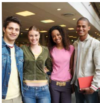
Join the Friends of the Decatur County—Gilbert H. Gragg Library today!

fill out the membership form either by visiting the Decatur County—Gilbert H. Gragg Library in person, or by downloading one online at www.swgrl.org/decatour_friends.php . Membership benefits can be yours for as little as $1.00!