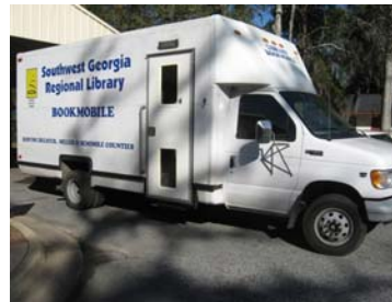
Don't miss the Bookmobile at a stop near you!

Come visit the Bookmobile and see what you've been missing!