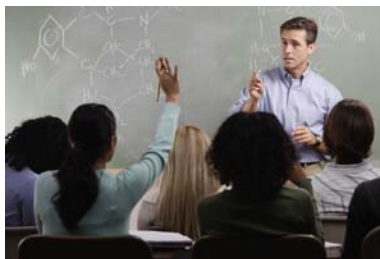
The Southwest Georgia Regional Library System can make a teacher's life easier this year!

website at www.swgrl.org/homework_alert.php . Simply fill out the online form with the assignment details, and we will be able to gather materials from our library and others around the state. This way, the materials will be easily accessible for your students.