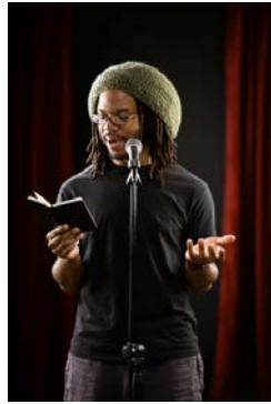
Share your original poems or read your favorite poems at Open Mic Night this month!

Do you like writing poetry? Do you want to share your best work with others? Grab a few of your best poems and join us this month for open mic afternoon! Open mic afternoon will be at the Seminole County Public Library on