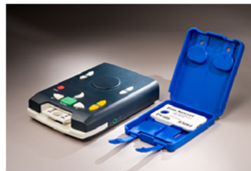
Get your hands on a new digital player available at the Bainbridge Subregional Library for the Blind and Physically Handicapped!

229.248.2680 or 1.800.795.2680 for more information on qualifying and signing up for this service.