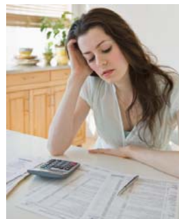
Don't stress out about taxes! Visit the library to have your taxes prepared by IRS-trained volunteers!

To receive the free tax preparation and e-file, please bring the following documents with you: All W-2s and 1099s (if any), Social Security Cards or Taxpayer Identification Numbers (ITIN) for all family members, a copy of your 2008 tax return (if available), a bank account and routing number (if choosing to direct deposit your refund, and a valid photo identification.