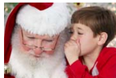
Don't miss the opportunity for your child to meet Santa at the library!

Santa will also be visiting the Miller County—James W. Merritt, Jr. Memorial Library! Catch him on Saturday,