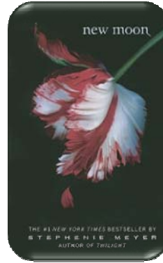
Join us this month to see who is the smartest family—the Cullens or the Quileutes!

family and see which family has the most New Moon smarts! Pick a family at the Seminole County Public Library on Thursday, November 12 at 4:30 p.m. Brush up on your knowledge of New Moon and join forces with the most powerful family at the Decatur County—Gilbert H. Gragg Library on Tuesday, November 17 at 3:30