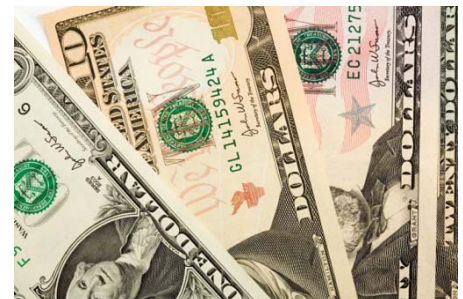
Discover our Hard Times Resource Guide available exclusively at www.swgrl.org !

So what are you waiting for? Point your browser to www.swgrl.org/hardtimes.php and discover all of the resources that are available to you!