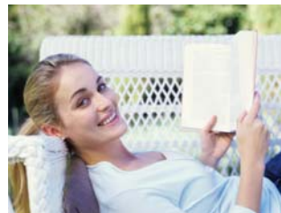
This year, give the gift that the entire community can enjoy!