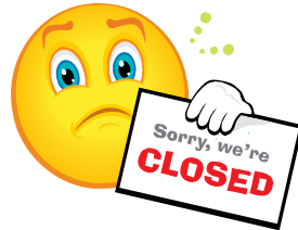
The library will be closed several days during December and January!

Pay attention to these important dates! The Southwest Georgia Regional Library System will be closed Thursday, December 24, 2009 through Saturday, December 26, 2009 to celebrate the Christmas holidays. All library locations will reopen regular business hours on Monday, December 28, 2009.