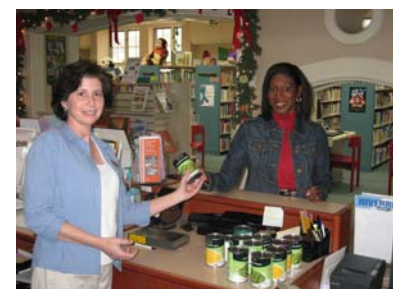
Participate in Food for Fines at all library locations this month!

2009. This offer will not be extended, so make sure you take advantage of this while it lasts!