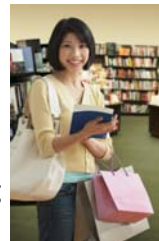
Turn to your library for your holiday shopping needs!

titles such as the Jones History of Decatur County for $35.00 or I Remember Life in a Small Town for just $7.50 at the library at the Decatur County—Gilbert H. Gragg Library. You can also purchase Marriage Records of Miller County 1893—1994 for $10.00 at the Miller County—James W. Merritt, Jr. Memorial Library.