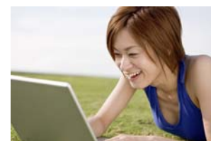
Follow the Southwest Georgia Regional Library System on Twitter and receive exclusive news and updates!

Are you on Twitter? Follow the library system at www.twitter.com/SWGRL and receive exclusive news and updates you won't see anywhere else! Launched in 2006, Twitter ( www.twitter.com ) is a free social networking service that enables its users to send and read other users' updates known as "tweets". So what are you waiting for? Follow us today on Twitter!