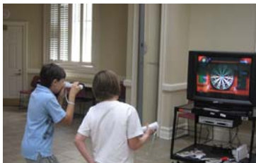
Get your game on at the library this month!

Hey, teens! Has the thought of going back to school got you down? Need some after school relief this month? Join us at the Seminole County Public Library on Thursday, August 13 at 4 p.m. as we play games on the Nintendo Wii and the PlayStation 2! Can't make it then? Well be