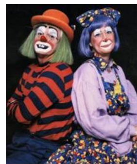
Join clowns Fuzzy and Snuggles for face painting and balloon animals this month!

the Seminole County Public Library on Saturday, August 1 from 1—3 p.m. Can't make it then? Well join us at the Decatur County—Gilbert H. Gragg Library on Saturday, August 8 from 1—3 p.m. as we say goodbye to the lazy days of summer.