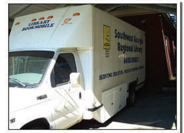
Don't miss the Bookmobile coming to a stop near you!