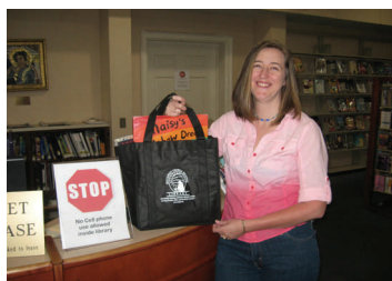
Stop by your library and pick up a recyclable reusable canvas bag today!

Your library is going green! How? No longer will you have to put books in all those plastic bags you receive from the library. No longer will you have to worry about throwing away those