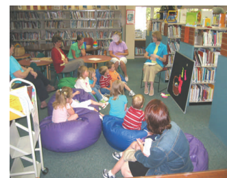
Toddler Tales will take a break on April 7 and 9 at the Decatur

a.m. and 4 p.m. , due to library renovations. In the meantime, be sure to visit one of our other libraries for great reading materials. Or, visit our website at www.swgrrl.org for reading recommendations for your little ones.