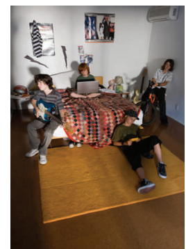
Stop the Spring Break blues and play Guitar Hero at the library!

This program is designed for ages 10—18.