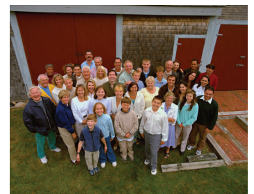
September is Reunion Planning Month!

Whatever your reunion interests are, find the information you need at your library!