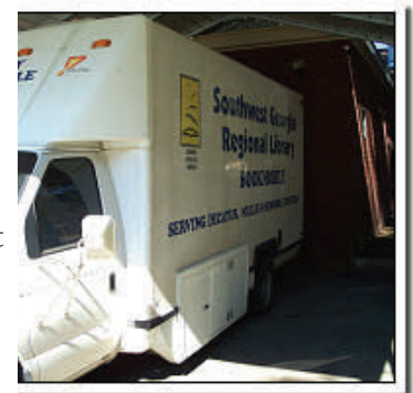
Visit the Library's Bookmobile

Come visit the Bookmobile and see what you've been missing!