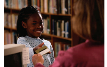
Sign up for your library card today!

databases and 2000 full-text journal articles. It's easy to get a library card, and the first one is free! Library cards are free to all residents of Georgia. Persons who attend school, own property, or work in Georgia are eligible for a library card. So what are you waiting for? Sign up today!