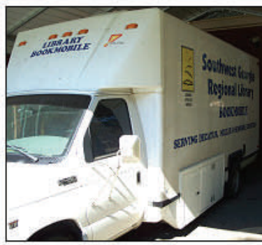
Visit the Library’s Bookmobile!

Come visit the Bookmobile and see what you’ve been missing!