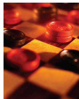
Test your board game skills at the Decatur County—Gilbert H. Gragg Library on Tuesday, November 18!

will surprise and entice your board game skills! This program is designed for all ages, so grab a friend and play board games with us at the library!