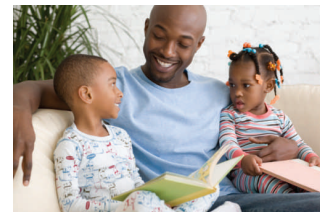
Don't miss Toddler Storytime at the Seminole County Public Library at 10:30 a.m. and 4 p.m. all month long!

Toddler Storytime is a great way for your child to interact with others and learn social skills. Won't you join us?