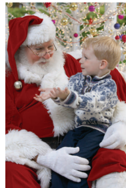
Join us as Santa visits the Decatur County—Gilbert H. Gragg Library and the Miller County—James W. Merritt, Jr. Memorial Library!

Don't miss the chance for your child to meet Santa!