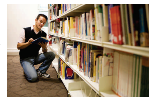
Donate a book in the name of that special someone to the library. It makes a great holiday gift!

library can order the item. This is a great gift idea for that hard to buy person in your life. Each book will have a special bookplate inserted recognizing your loved one. This year, give the gift that the entire community can enjoy!