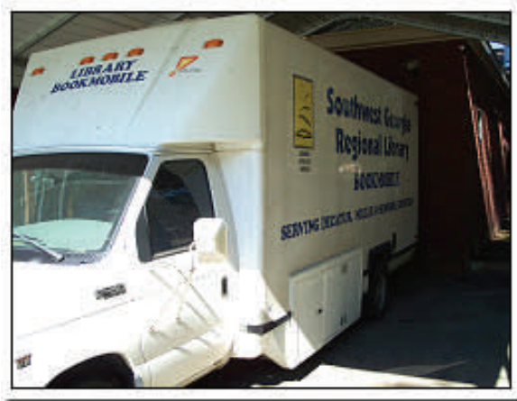
Visit the Library's Bookmobile!

Come visit the Bookmobile and see what you've been missing!