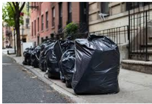
Tightly closed ready for collection