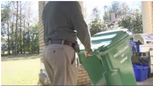
Remember to remove bins from street view