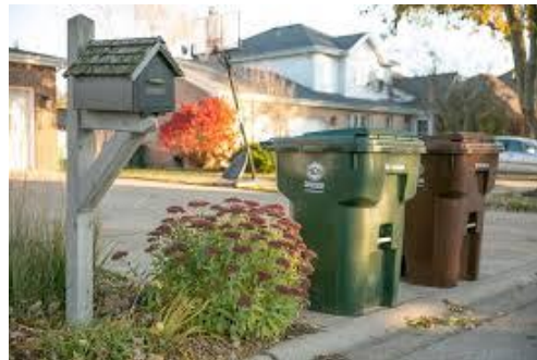
Bins placed neatly for collection