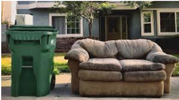
One bulky item - neatly closed trash bin