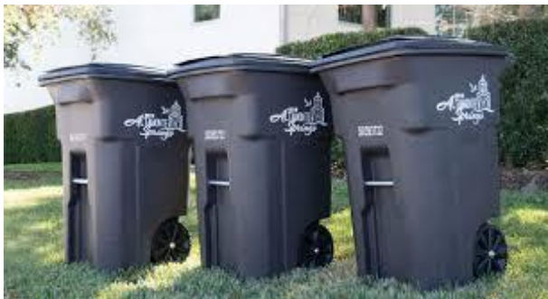
Lids closed area around bins trash free no overloading