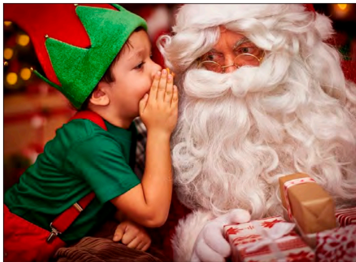
SANTA IS SCHEDULED FOR AN EARLY VISIT

GSHABA and the Schuylkill Haven Recreation Department will again host the annual Children's Christmas Stroll along Main Street on Saturday morn-