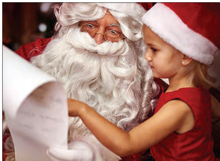
SANTA IS SCHEDULED FOR AN EARLY VISIT

GSHABA and the Schuylkill Haven Recreation Department will again host the annual Children's Christmas Party and Main Street Stroll on Saturday