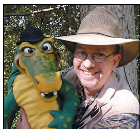
WAGSTAFF & COMPANY

Entertainment, good food and activities for all ages are three outstanding reasons to head to the 15th annual Island Park Festival on The Island Saturday, Aug. 20. Located on Fritz Reed Avenue (off Dock Street), the Festival activities begin at 2 p.m. and continue through 10 p.m. This is a rain or shine event. Free parking will be available on the Island.