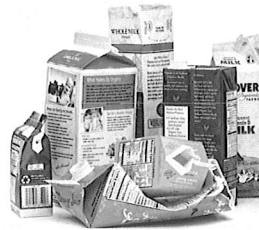
Food & Beverage Cartons