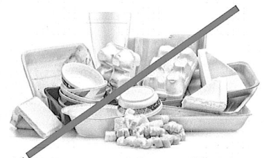
NO Foam Cups & Containers

(Find a recycling site at plasticfilmrecycling.org .)