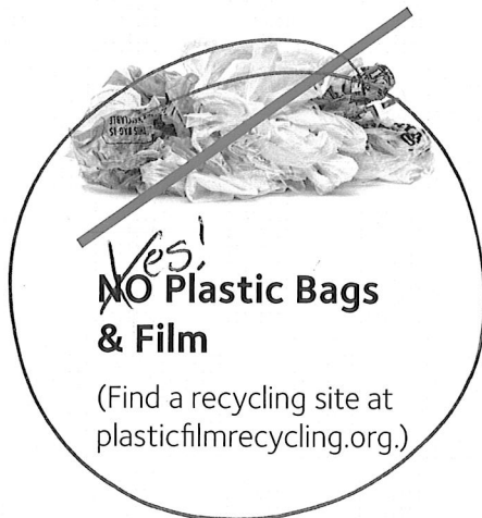
Yes! NO Plastic Bags & Film

(Find a recycling site at plasticfilmrecycling.org .)