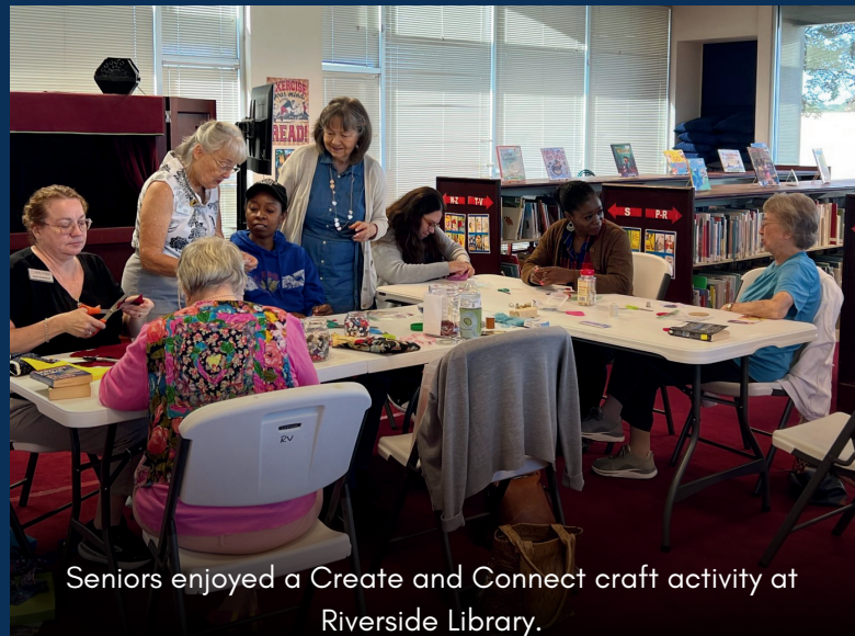
Seniors enjoyed a Create and Connect craft activity at Riverside Library.