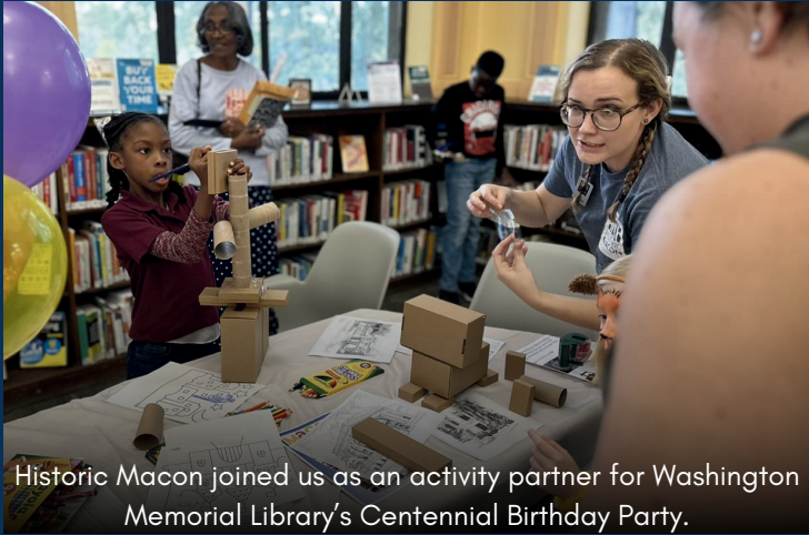
Historic Macon joined us as an activity partner for Washington Memorial Library's Centennial Birthday Party.