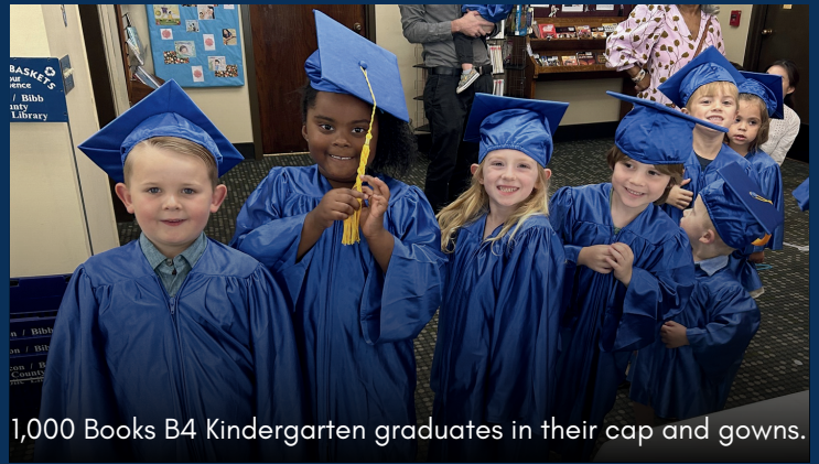
1,000 Books B4 Kindergarten graduates in their cap and gowns.