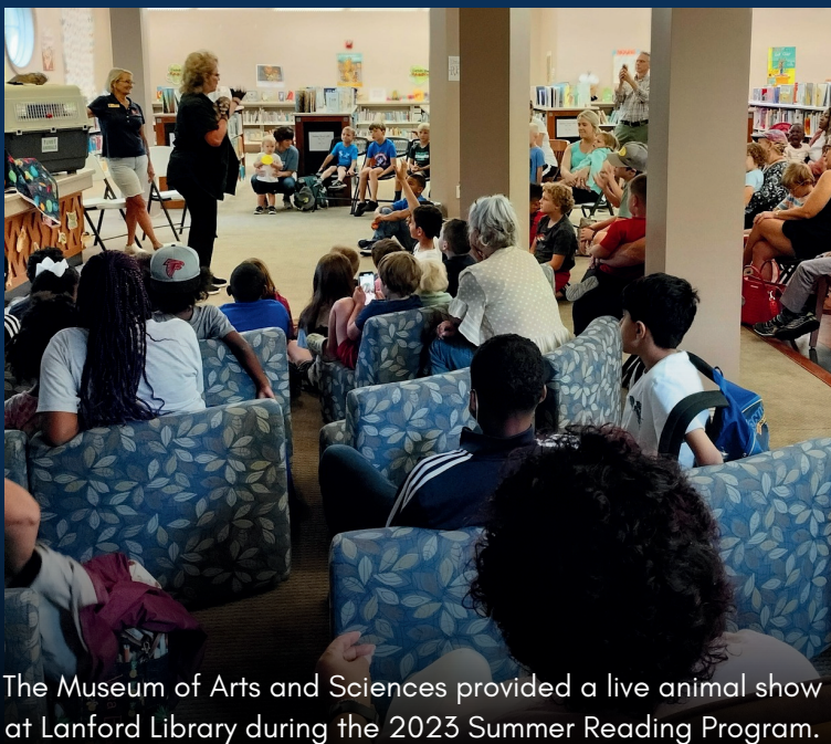
The Museum of Arts and Sciences provided a live animal show at Lanford Library during the 2023 Summer Reading Program.