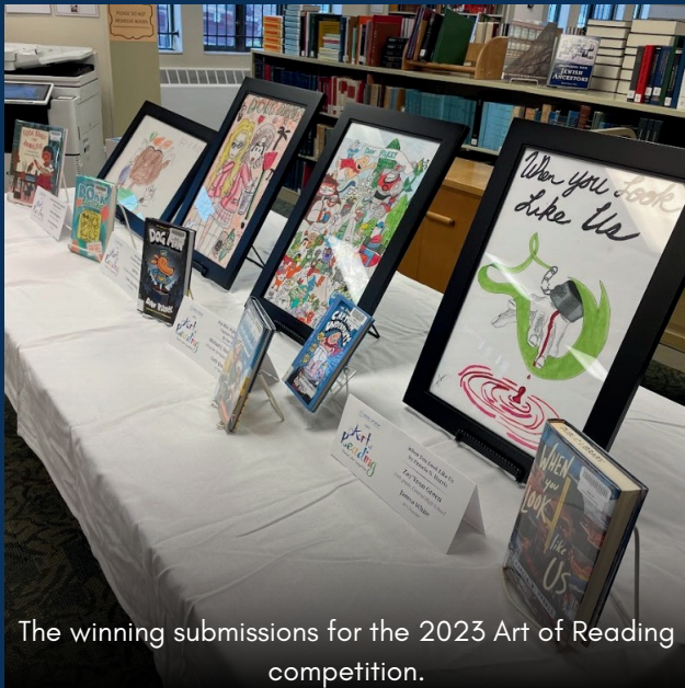
The winning submissions for the 2023 Art of Reading competition.