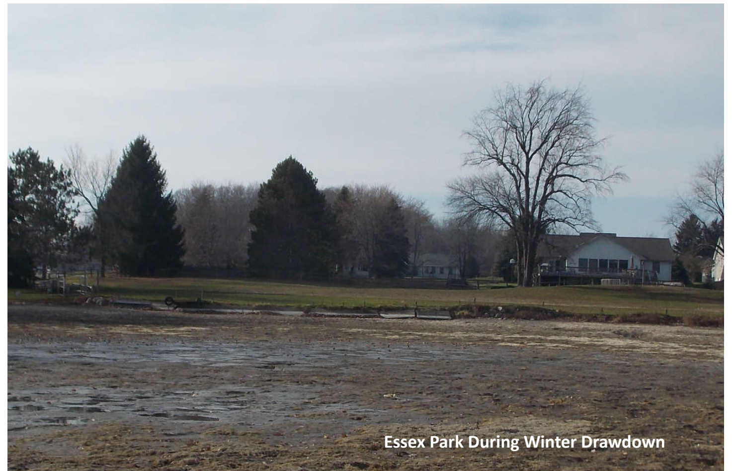
Essex Park During Winter Drawdown