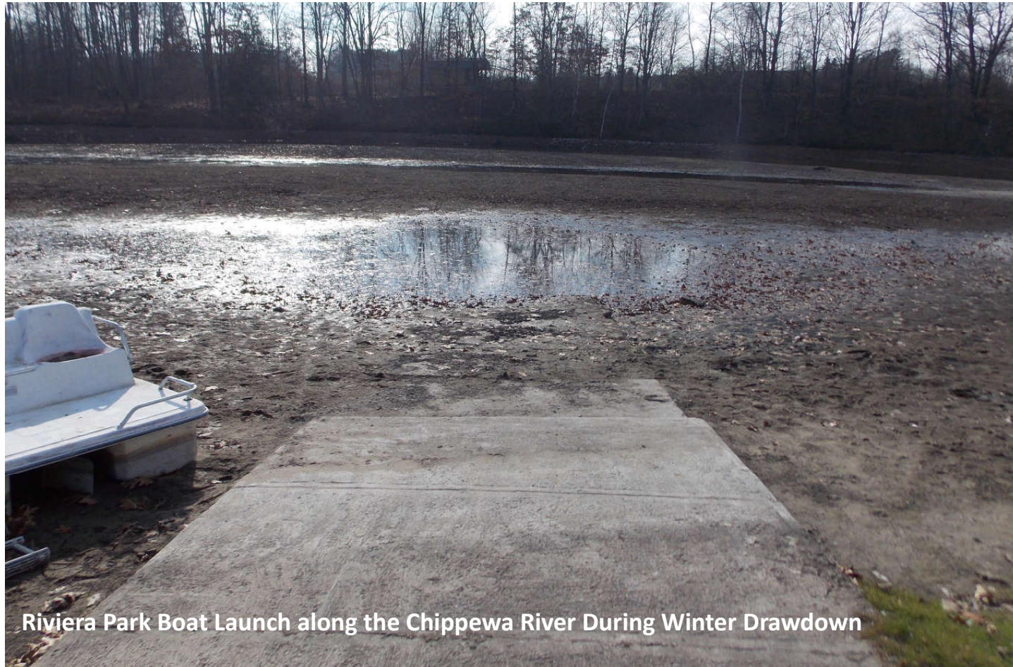
Riviera Park Boat Launch along the Chippewa River During Winter Drawdown

The Lake Restoration Committee has identified several areas around the community where restoration work is necessary. Targeted areas include: