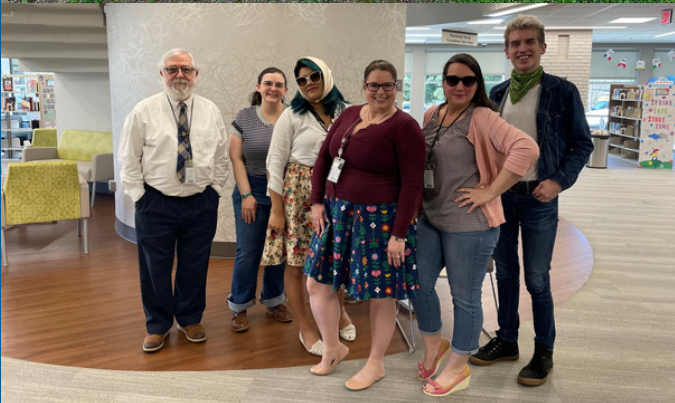
Library staff dressed up in period attire to celebrate the release of the 1950 census.