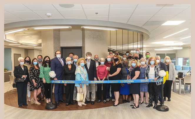
Ribbon cutting, September 17, 2020