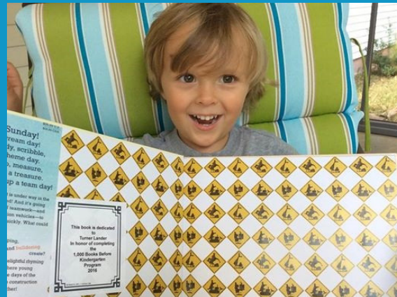
1000 BOOKS READ BEFORE KINDERGARTEN? DONE!