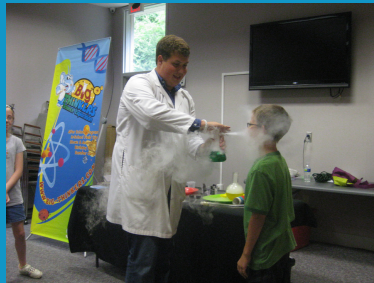
SUMMER READING PROGRAM WAS A HUGE HIT, AS ALWAYS!