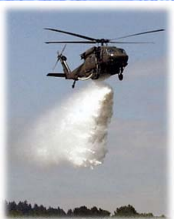
JFTB's Firehawk in action