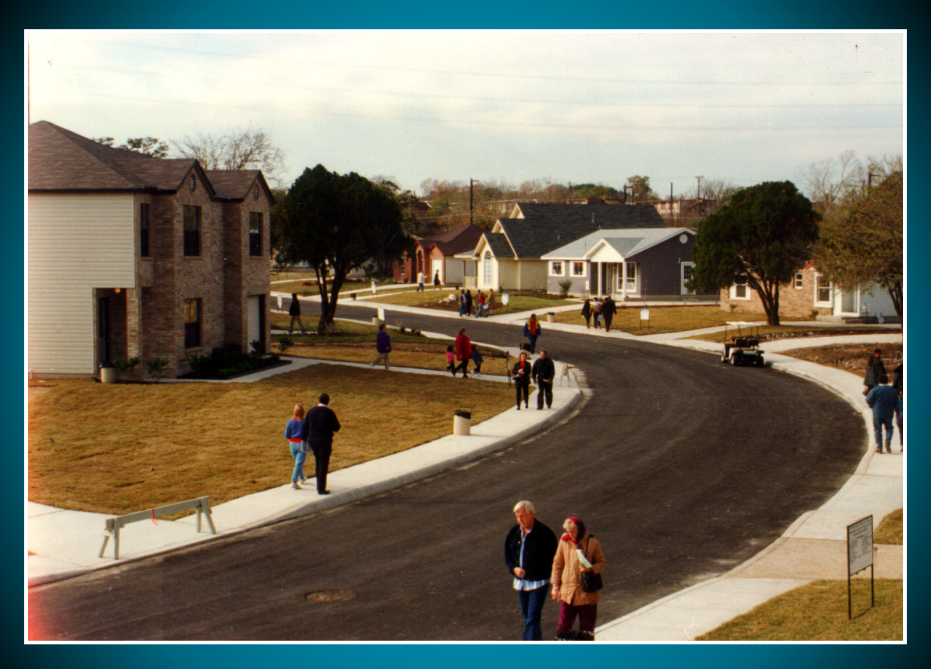
Coliseum Oak - San Antonio, TX..... After