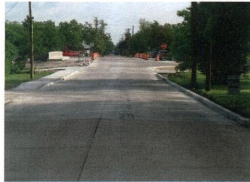
Figure 2. Looking North along Main Street