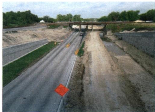
Figure 4. Looking West from Bridge