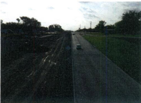
Figure 3. Looking East from Bridge