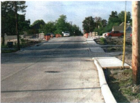
Figure 1. Looking South along Main Street