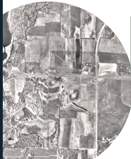
An aerial image from 1970 shows the intersection of MN 5 and MN 41. MN 5 remains a 2-lane highway to this day.

Driving the Transportation Needs for Today and Tomorrow