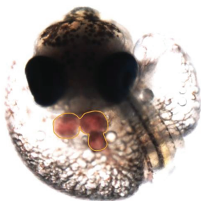
Normal F. heteroclitus heart

Coal tar sealant is also a known toxin to some species of fish and macroinvertebrates. Some species of fish exposed to coal tar sealant were found with developmental disabilities.