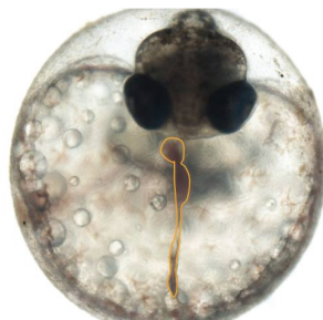
F. heteroclitus heart after exposure to PAH mixture

Mud Minnow with an under-developed heart after exposure to PAHs.