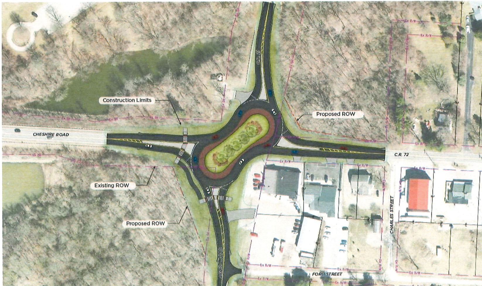
Alternative 2 - Peanut-shaped roundabout (preferred)