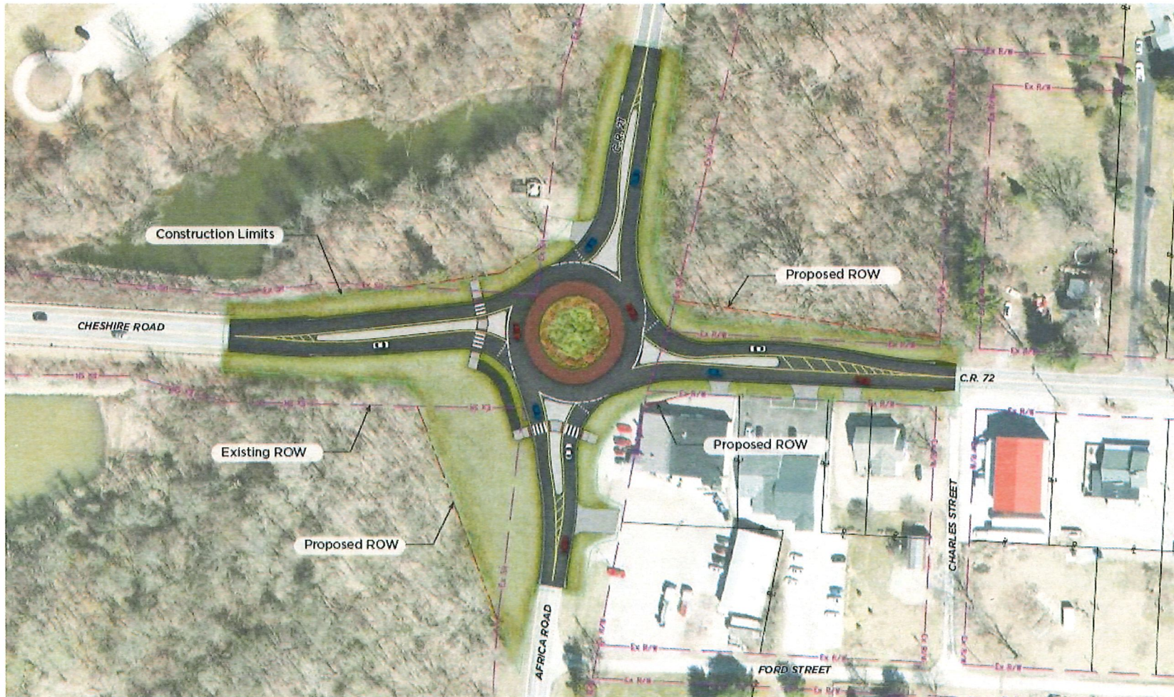
Alternative 1 - Circular roundabout