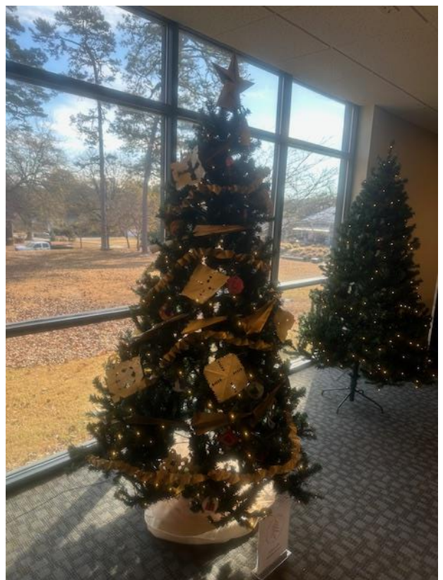
(Above: Adairsville Middle School)