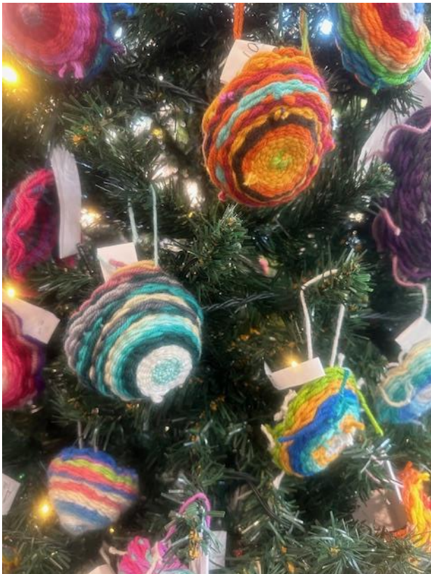
(Above: Woodland Middle School)