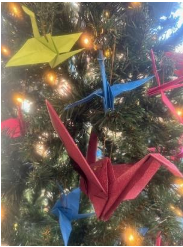
(Above: Cartersville Middle School)