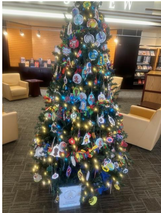
(Above: Clear Creek Elementary School)